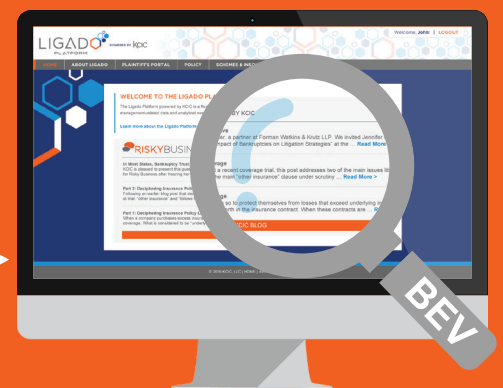
Bankruptcy Evidence Verification tool (BEV)